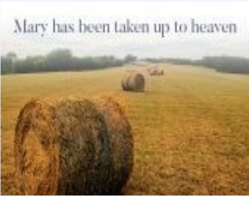
Mary has been taken up to heaven