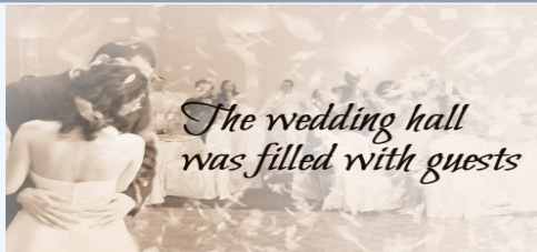
The wedding hall was filled with guests