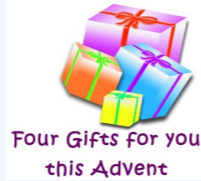
Four Gifts for you this Advent

Blessed are those who trust in the LORD, whose trust is the LORD. They shall be like a tree planted by water sending out its roots by the stream. It shall not fear when heat comes, and its leaves shall stay green; in the year of drought it is not anxious, and it does not cease to bear fruit. Jeremiah 17:7-8